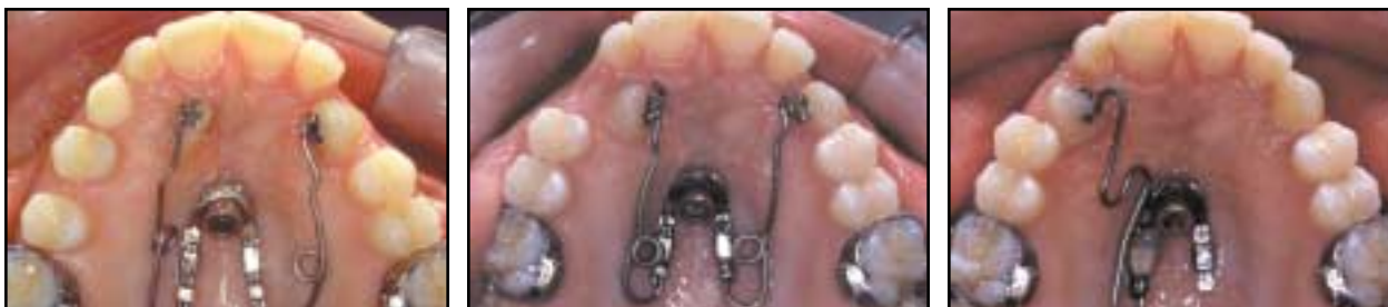
Fig. 6 Progress of impacted canines during four months of treatment with ISDS Type 2.