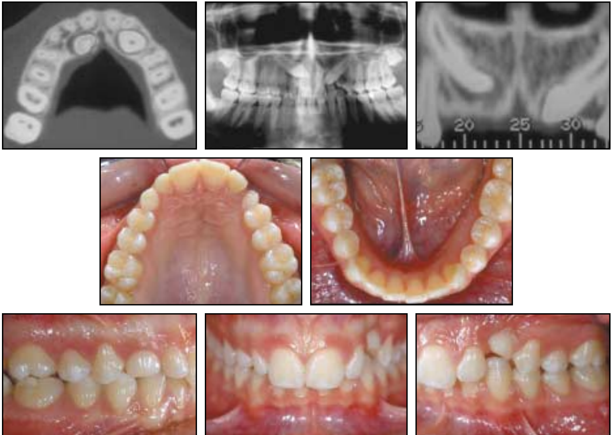
Fig. 3 22-year-old female patient with retained maxillary deciduous canines and impacted maxillary permanent canines before treatment.