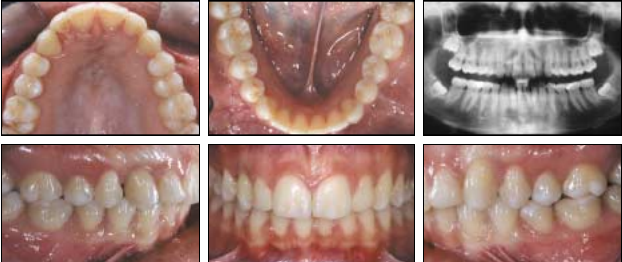
Fig. 8 Patient after 16 months of treatment.