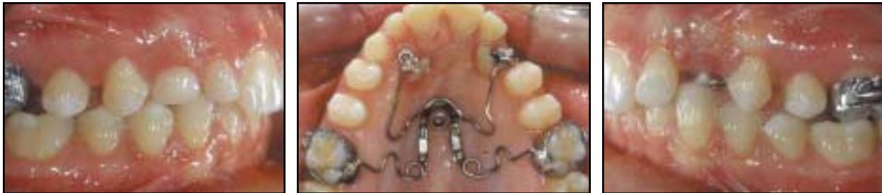
Fig. 5 Distalization of maxillary molars and extrusion of impacted canines after five months of treatment.