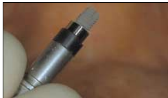
Fig. 1 Straumann Orthosystem palatal implant (4mm long, with 2.5mm transmucosal neck).

Under local anesthesia, the palatal mucosa is removed with a mucosal trephine (4.2mm in diameter). Pilot drilling of the implant site is then performed with a standard round bur and profile drill.