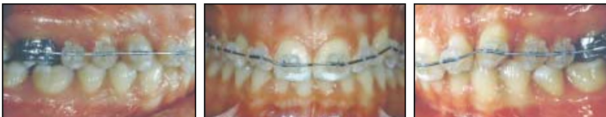
Fig. 7 Finishing phase using fixed appliance.

The finishing phase, including root torque correction, was performed with about six months of fixed appliance wear. At the end of treatment, crown veneers were recommended for esthetic improvement of the upper lateral incisors (Fig. 8).